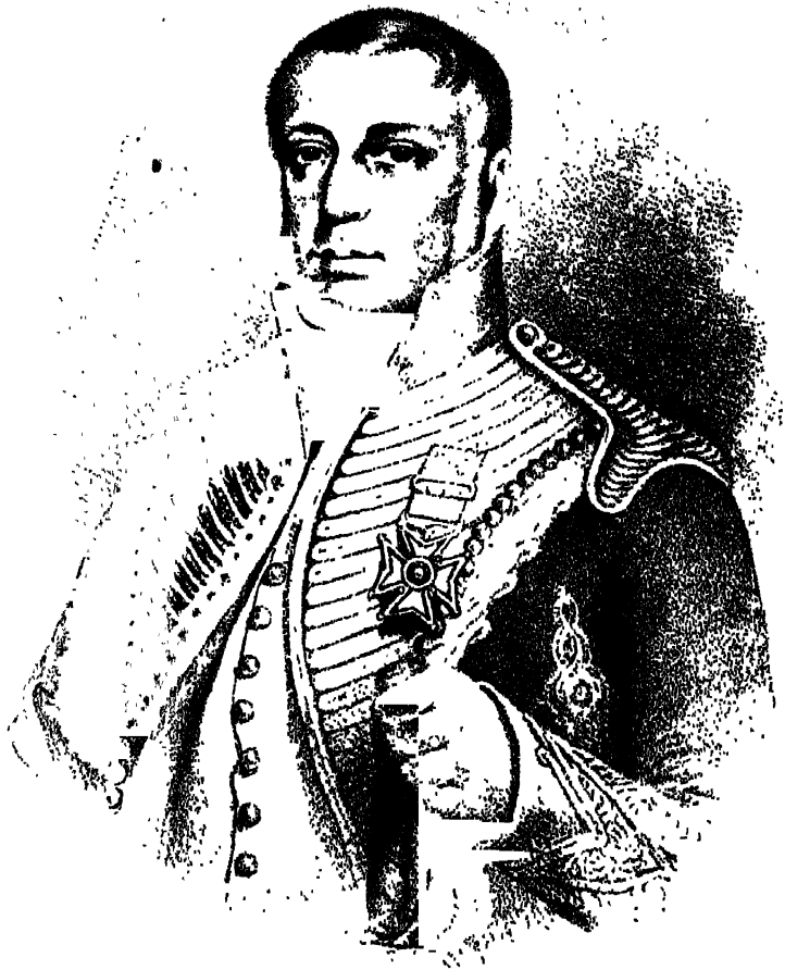
LIEUT.-COLONEL JAMES SKINNER, C.B.

[From a plate in the "Military Memoir of Lieut.-Col. James Skinner, C.B."]